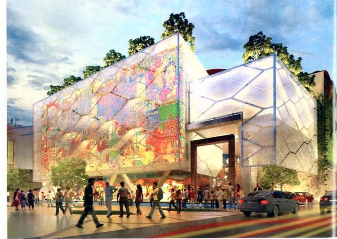
TEXT: AMITA SARWAL PHOTOGRAPHS & ILLUSTRATIONS COURTESY: URBNArc PTE LTD & RGSA ARCHITECTS, SINGAPORE

A Glowing Lantern for Little India' serves as 'an urban form where the rich diversity of Indian culture is celebrated, nurtured and allowed to grow,' say Gaurang Khemka, Principal of URBNArc Pte Ltd, and Greg Shand of RGSA Architects, winners of the Singapore IHC design competition. The concept won as it best translated IHC's vision of an iconic, unique and sustainable building that blends both traditional Indian and modern architectural elements.